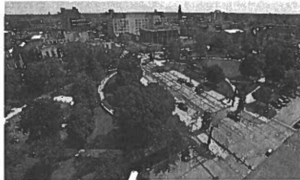
Perry Square is shown July 15, 2021, in Erie. State Street bisects the east side, left, and west side of the popular park.