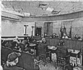
Erie County Council, shown here on Tuesday, voted down a resolution to use $5 million in American Rescue Plan funds toward Penn State Behrend's Project RESOLVE.

"I think everyone understands that," she said.