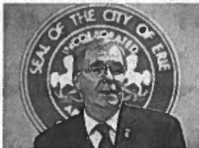
Erie Mayor Joe Schember.