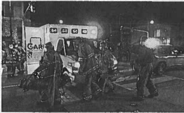
Erie firefighters and EmergencyCare personnel respond to an accident at 12th and State streets in Erie on Dec. 8. Personal protective equipment for emergency responders can be covered by the city's American Rescue Plan funding.