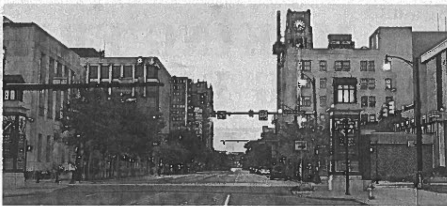
The skyline of downtown Erie is shown Aug. 18 looking south on State Street from Perry Square.

Among the ideas being discussed is how Erie County communities can improve access to high-speed internet. Erie County used CARES Act funding to