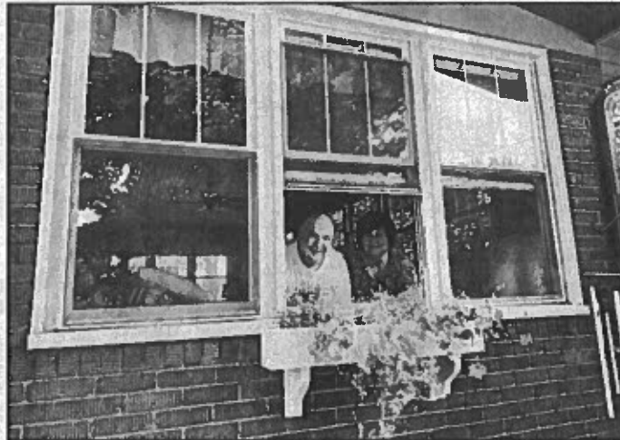
The Browns used grant funds to offset the cost of installing 21 energy-efficient windows in their Corry home.

The Erie County Renaissance Block Program awards up to $150,000 per application or up to $5,000 awarded per property. It is a matching program that helps finance eligible exterior repairs, permanent improvements, and streetscapes. Funds can also be used to improve publicly owned property that is targeted to improve the block's visual appearance.