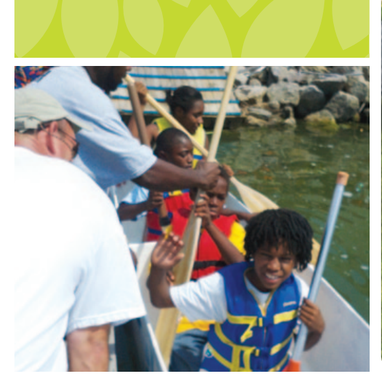
Bayfront Maritime Center