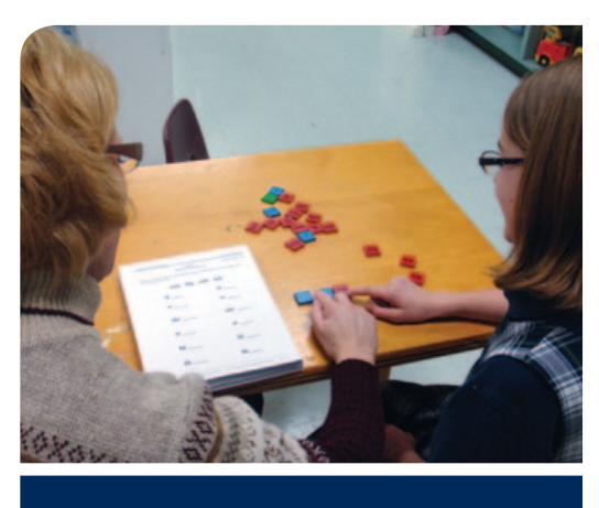
Top and bottom middle: Erie City Mission. Bonkers 4 Jesus Sports, Arts & Science Camps. Bottom right: French Creek Council Boy Scouts of America, Cub Scouts Day Camp. Bottom left: Saint Luke School, Barton Reading and Spelling System.