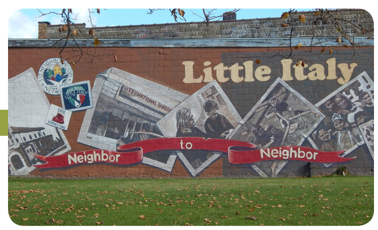
Gaming funds support the Sisters of St. Joseph Neighborhood Network as they protect and restore the Little Italy historic district.