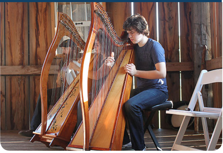
Each year, thousands celebrate Scottish arts, sports, and history at the Edinboro Highland Games, made possible by gaming funds.

To promote well-being, foster civic pride, drive tourism, and attract, retain, and mobilize creative talent and innovative businesses through cultural, heritage, service, and recreational organizations and projects.