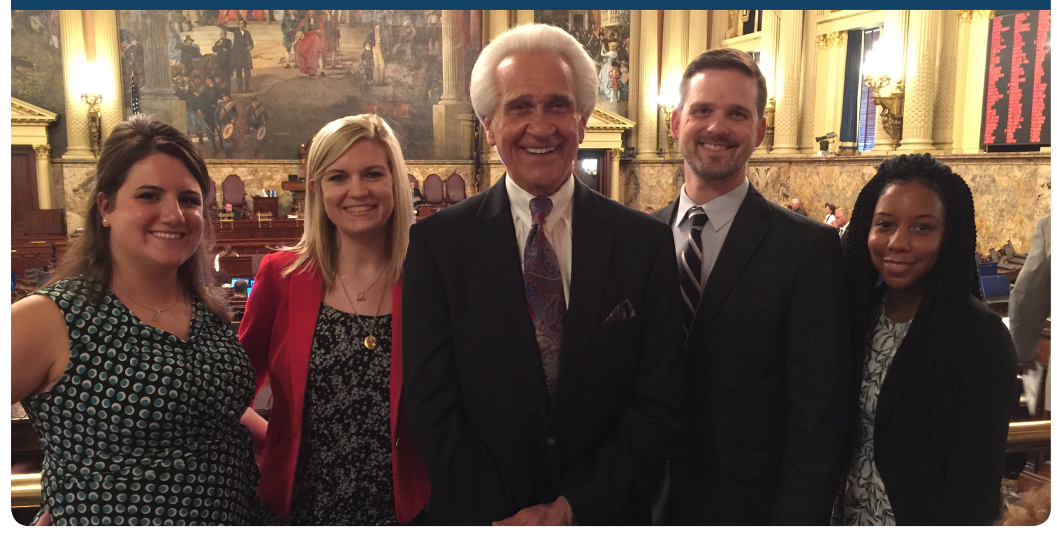
The Jefferson Educational Society uses gaming revenue to develop young leaders via its Civic Leadership Academy.