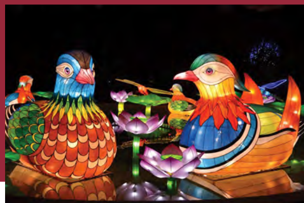
Erie Zoo Glow Wild received $174,212.