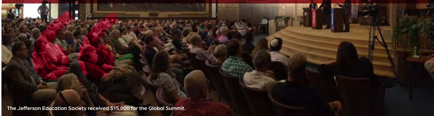
The Jefferson Education Society received $15,000 for the Global Summit.

Director of Marketing and Community Engagement