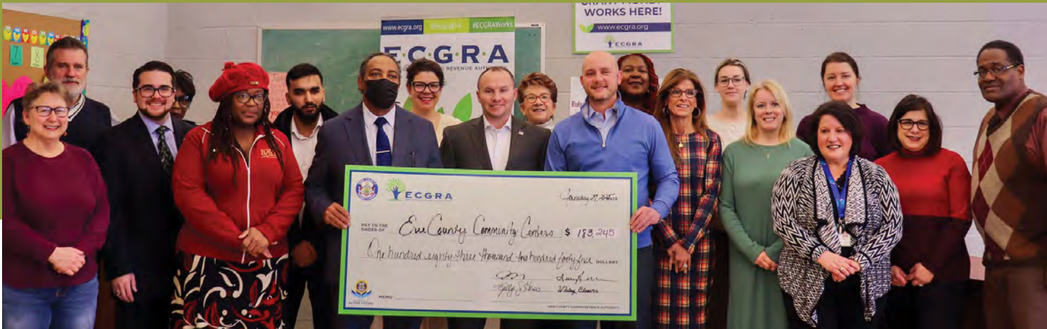
2025 Grant Awarding – ECGRA awarded $183,245 to 16 deserving community centers.