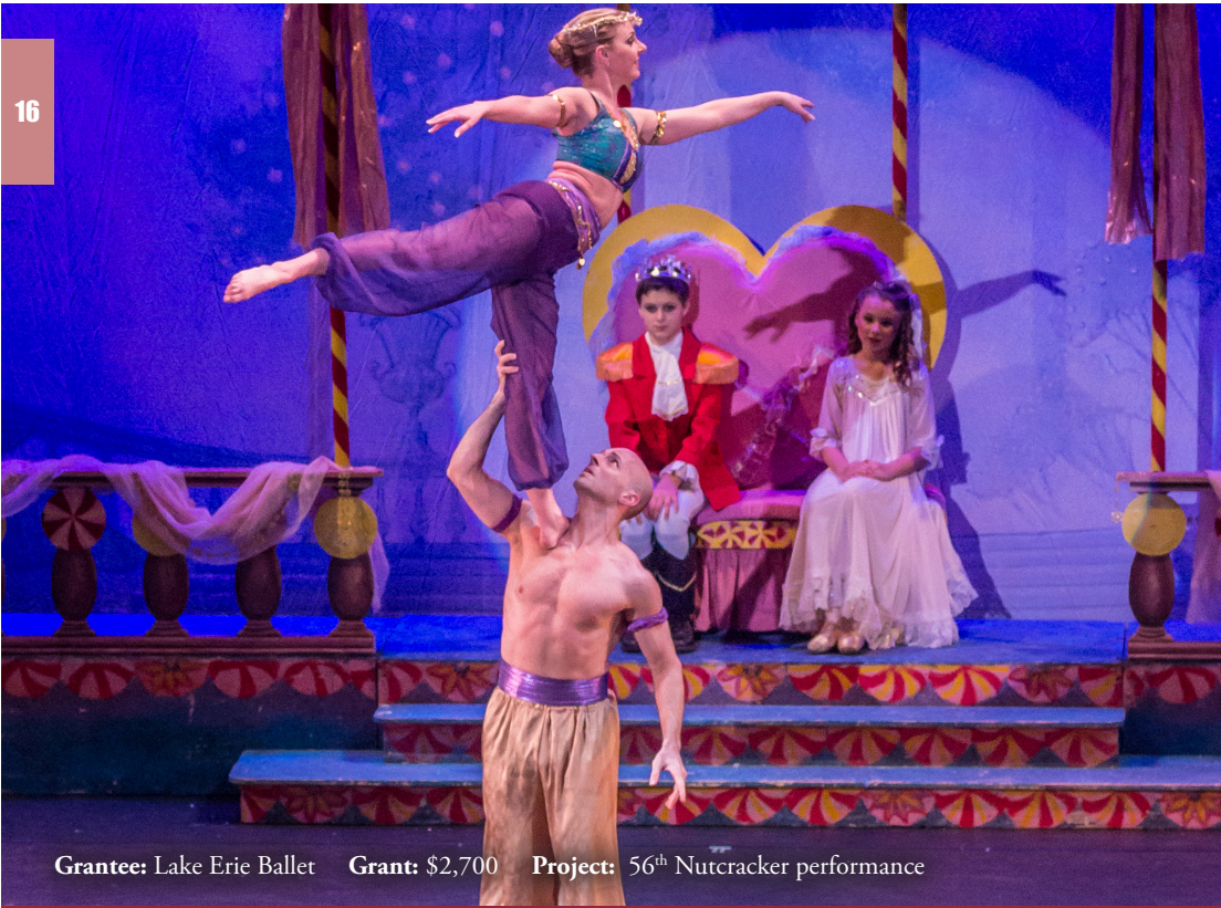
Grantee: Lake Erie Ballet Grant: $2,700 Project: 56 th Nutcracker performance