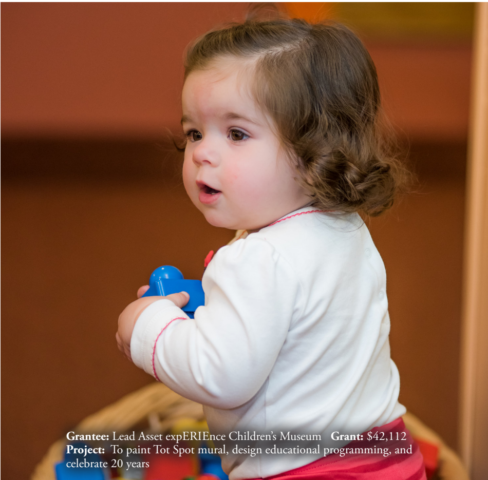
Grantee: Lead Asset expERIEence Children's Museum Grant: $42,112 Project: To paint Tot Spot mural, design educational programming, and celebrate 20 years