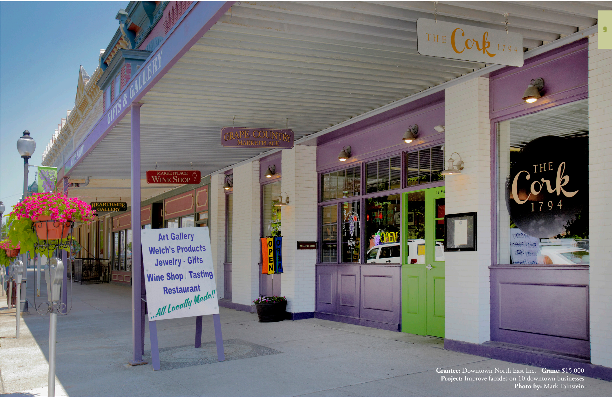
Grantee: Downtown North East Inc. Grant: $15,000 Project: Improve facades on 10 downtown businesses

$630k Invests $151,000 in Erie County Community Assets; $630,000 has been invested