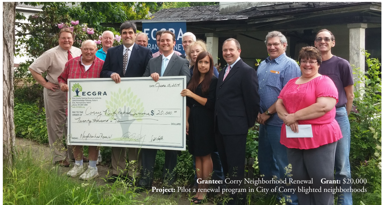
Grantee: Corry Neighborhood Renewal Grant: $20,000 Project: Pilot a renewal program in City of Corry blighted neighborhoods